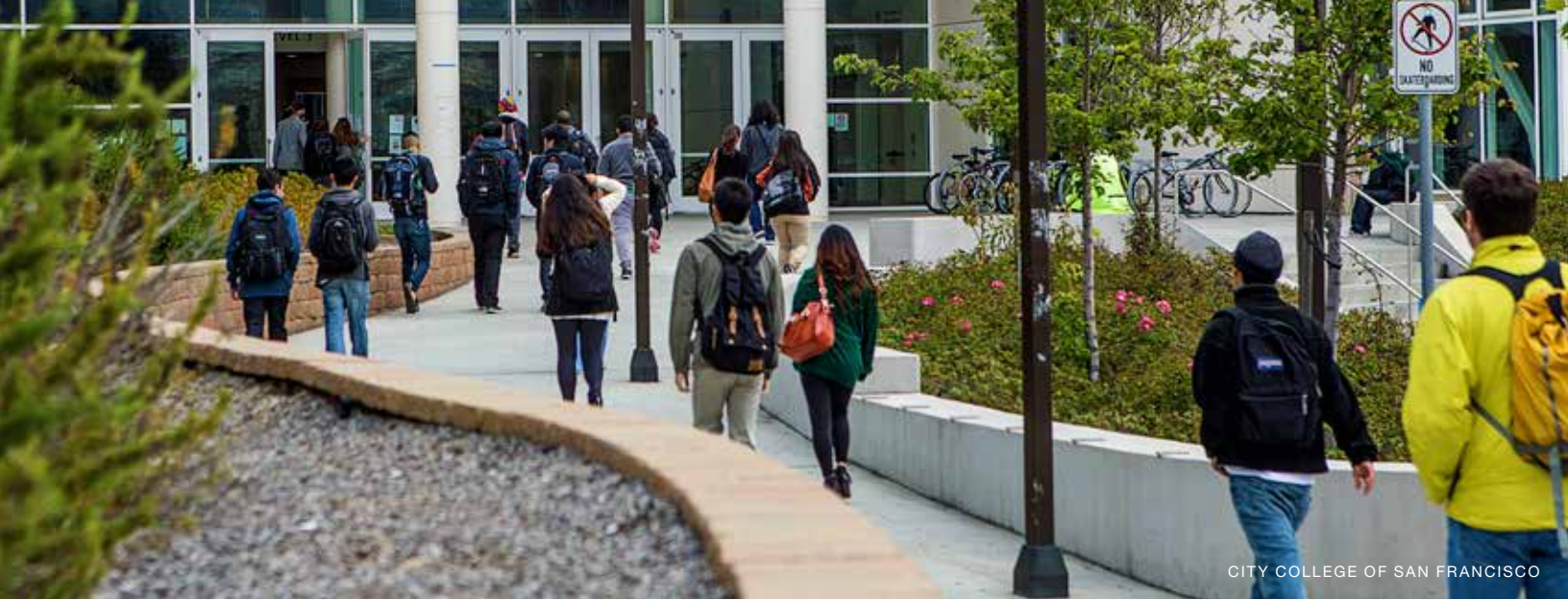
CITY COLLEGE OF SAN FRANCISCO