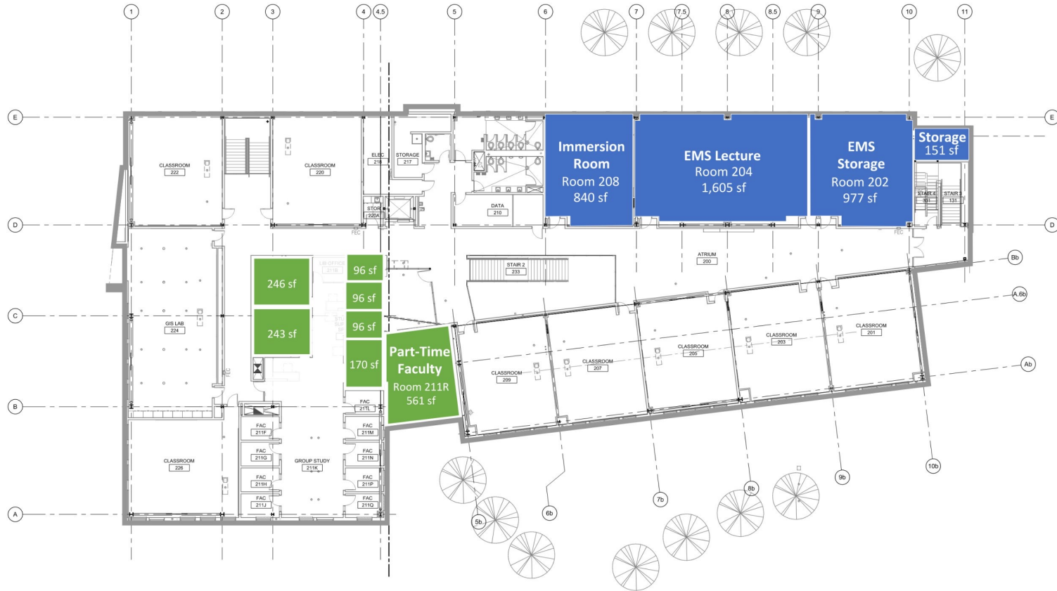
Program Adjustments - Level 2