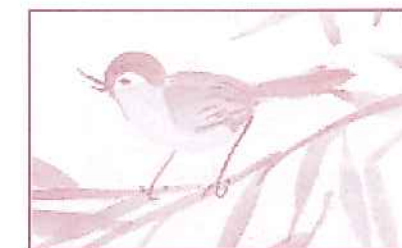
Amy Wada Brush Painting