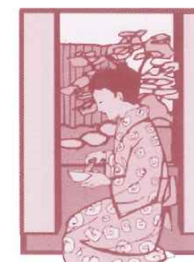
Japanese Tea Ceremony