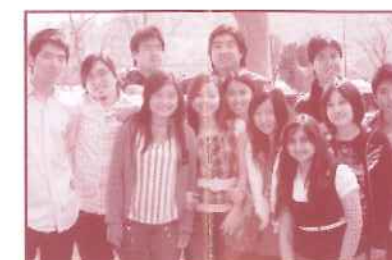
2007 Asian Pacific Islander Heritage Month Planning Committee