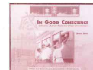
Shizue Seigel "In Good Conscience"