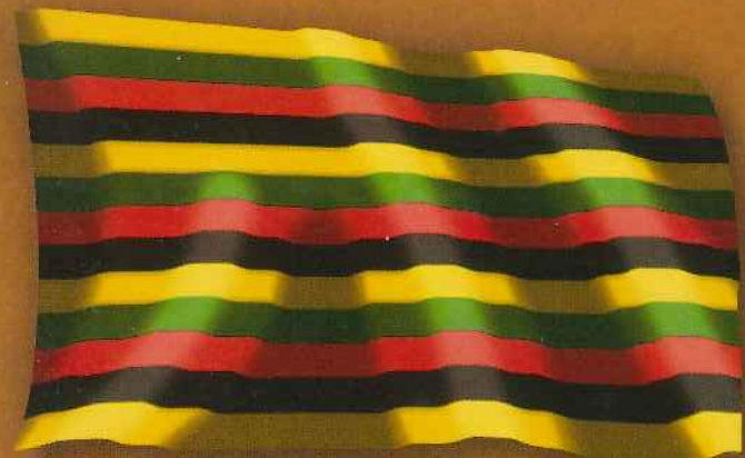
13-Stripe Afro-American Flag GOLD is for the richness of the people; GREEN is for the earth; RED is for the blood shed; and BLACK is for the people

Foothill College 2009 Black History Month events are made possible by contributions from numerous organizations, including: Alpha Kappa Alpha Sorority Inc., Rho Delta Omega Chapter Alpha Phi Alpha Fraternity Inc., Eta Sigma Lambda Chapter Associated Students of Foothill College (ASFC) ASFC Activities Board ASFC Ambassador Program Coalition of 100 Black Women, Silicon Valley Chapter Foothill College Adaptive Learning Division Foothill College Biological & Health Sciences Division Foothill College Bookstore Foothill College Brother-to-Brother Foothill College Business & Social Sciences Division Foothill College Computers, Technology & Information Systems Division Foothill College Counseling & Student Services Division Foothill College Dance Department Foothill College Extended Opportunities Programs & Services (EOPS) Foothill College Financial Aid Office Foothill College Fine Arts & Communication Division Foothill College Health Services Office Foothill College Language Arts Division Foothill College Learning Resource Center & Library Foothill College Outreach & Retention Office Foothill College Physical Education & Human Performance Division Foothill College Physical Sciences, Mathematics & Engineering Division Foothill College Student Affairs & Activities Office Foothill College Student Development & Instruction Office Foothill Commission Pepsi-Cola