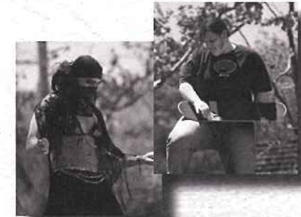
Drag Contest & Plaza Party