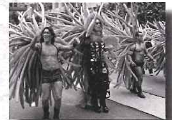
San Jose Gay Pride Parade