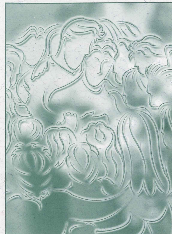
LOVE IS ALL YOU NEED (2000) Created by Foothill student Abe Lam