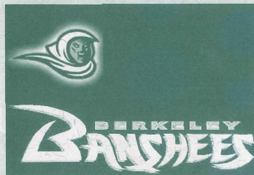
Women's Professional Football