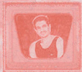
Saint John Wild 94.9 DJ